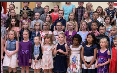
Children perform at the annual Holiday Concert.