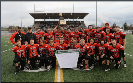
Winning state championships in sports creates great school spirit!

The town of Odessa is optimistic about the future and has a history of independence and entrepreneurial success. We are committed to maintaining and improving the opportunities available within the community in terms of employment, housing, community services and education. We look forward to welcoming a new, like-minded part-time superintendent to guide our school district in the coming years.