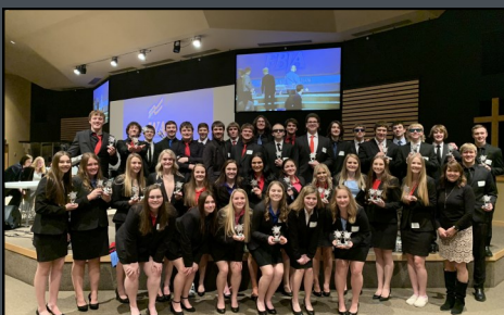
FBLA members compete and win at the state and national leadership conferences.